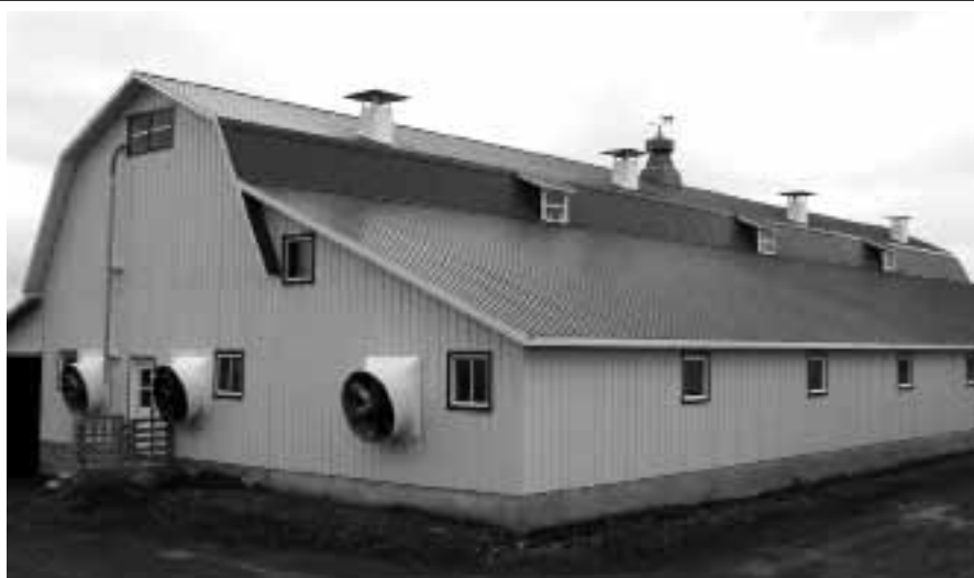
A confinement barn typical of that used on the AAFC type CC4 light control protocol.

Mating periods last for 35 days, and begin 55 days after the start of the SDs. Lambing takes place during the LDs. The lambs are weaned around day 55 (day 40 to 75) and are then exposed to LDs in order to promote eating and growth. After one week of dry-off, the ewes are flushed. This flushing therefore begins two to three weeks before introduction of the rams, and ends when the males are taken away or the females have the desired body condition. As a result, the average time between lambing and mating is approximately 80 days (60 to 95 days). Each group of ewes is mated every eight months (three lambings in two years). Ewes that are open when scanned 75 days after ram introduction are sponged to reduce the period