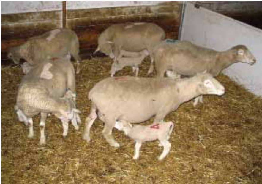
Ewes lambing three times in two years were ultrasounded to monitor their body condition.